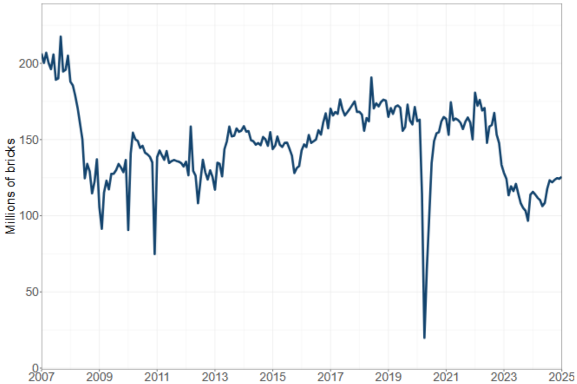
Figure 2: Monthly seasonally adjusted deliveries of bricks (in millions), Great Britain, 2007 to January 2025