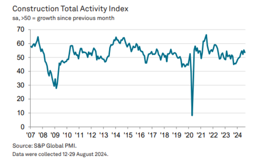
Figure 1: Monthly Construction Total Activity Index, start of series to August 2024.

S&P Global CIPS published their latest <u>construction purchasing managers index</u> for August 2024 on 5<sup>th</sup> September 2024.