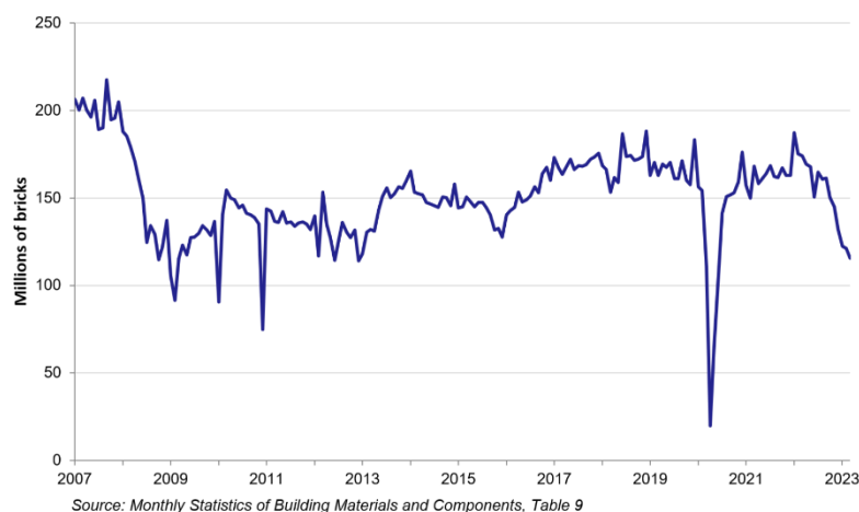
Chart 1: Seasonally Adjusted Deliveries of Bricks, GB Number of bricks